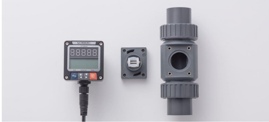
Device, paddle set and pipe fitting

The FP-AS510 paddle wheel flowmeter's three-pieces design of device, paddle set, and pipe, matches common market specifications. When wishing to replace the pipe, it is possible to replace the whole flowmeter set, allowing for more accurate flow detection, or in circumstances when the pipe cannot be replaced, it is possible to simply continue using the old one and save on the pipe replacement costs.