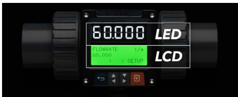
Double LED/LCD screen